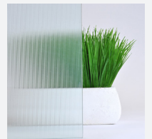
Thin Reeded 1/8"