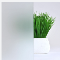
Frost Etch 100