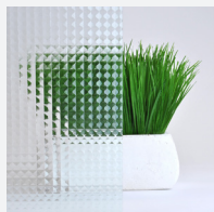
Cross Reeded 1/2"