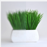
Frost Etch 20